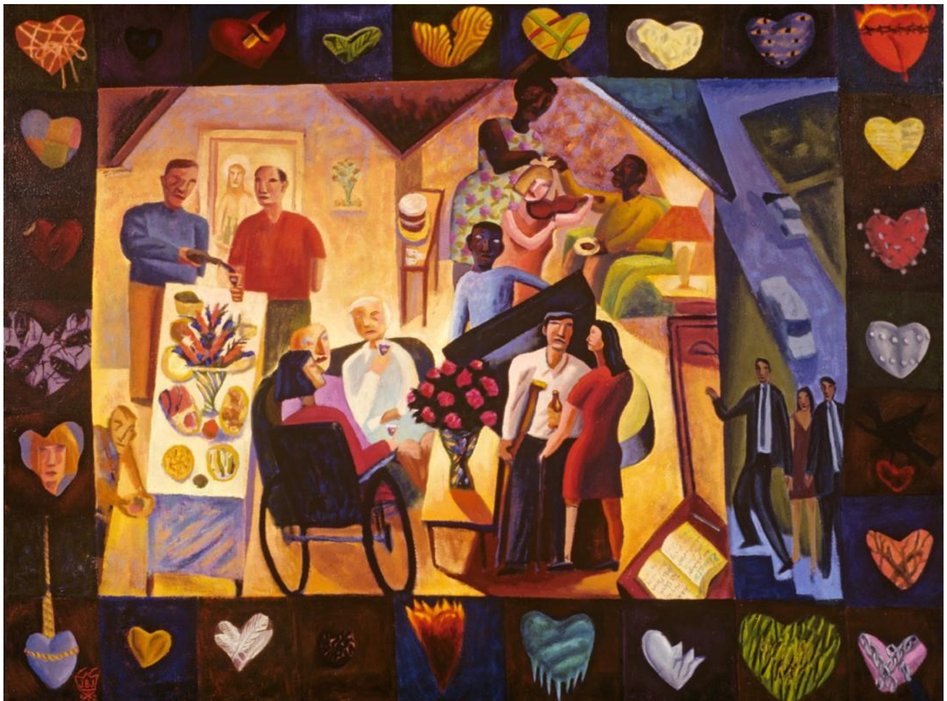
"The Party" by James B. Janknegt (bcartfarm.com). Used with permission.

Hymn Text from: The New Century Hymnal , The Pilgrim Press, Cleveland, Ohio © 1995 Used by permission.