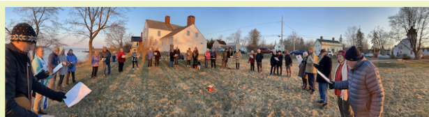
Easter Sunrise service at the Wilson Museum

Book groups and other adult study opportunities are held regularly throughout the year. Recent reads include: Sacred Earth , Sacred Nature ; The Amen Effect , and How Not to Be Afraid .